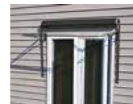
WeatherGuard™ rolled up